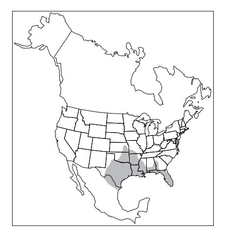
Fig. 2. Range of the armadillo in North America.

The armadillo ranges from south Texas to the southeastern tip of New Mexico, through Oklahoma, the southeastern corner of Kansas and the southwestern corner of Missouri, most of Arkansas, and southwestern Mississippi. The range also includes southern Alabama, Georgia, and most of Florida (Fig. 2).