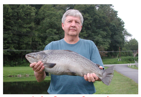
Lake Burton Record 11 pound, 2 oz Brown Trout

For bank anglers, the docks adjacent to the Moccasin Creek boat ramp, which is behind the hatchery, offer a chance to catch a trout, too. Small spinners and crankbaits can be effective during the twilight hours.