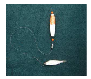
Floating Slip Rig

The mouth of tributary streams also hold trout and bluebacks during the winter. At the dam, fishing with live herring or shiners at depths from 15 to 30 feet works best. In the coves, slowly troll either live bait or Shad Raps.