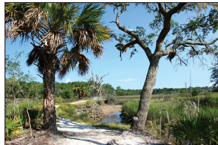
Scene on the Avian Loop Trail.

This one-mile loop takes you to the intracoastal waterway where you may catch a glimpse of osprey hunting for fish or dolphin swimming down river. A sandy causeway crosses the largest tidal creek that flows into the park. This is a great place to see the force and speed of tides flowing in and out of the marsh every six hours. Hanging from the trees is Spanish Moss, an epiphyte once used to stuff mattresses. Look but don’t touch because red bugs (or chiggers) reside in this enchanting plant. That’s why some Georgians still say, “Sleep tight; don’t let the bed bugs bite!”